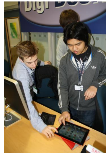
The launch of DigiDesk

DigiDesk builds on the earlier student e-ambassador project at the college. e-Ambassadors proved to be successful but impact was limited to classroom peers and teachers that the ambassadors regularly came into contact with. The DigiDesk makes e-learning support more accessible to the wider college community.